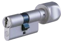
Knob cylinder no. 815 PSM Brass, satin nickel plated One side locking Other side aluminium knob, F1, various knob shapes available (figure shows shape H)