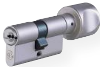
Knob cylinder no. 815 WSM Brass, satin nickel plated One side locking Other side aluminium knob, F1, various knob shapes available (figure shows shape H)