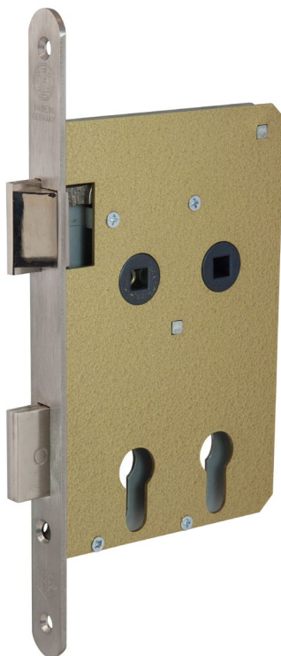
Article No. 8230