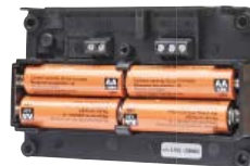
CESeasy door controller