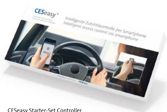
CESeasy Starter-Set Controller