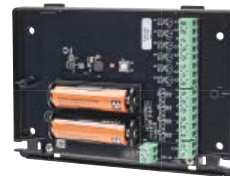
CESeasy communication module