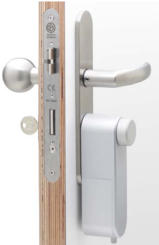
CESeasy motor cylinder