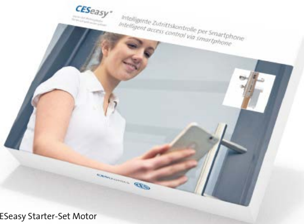
CESeasy Starter-Set Motor