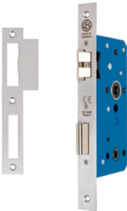
Article number 0522