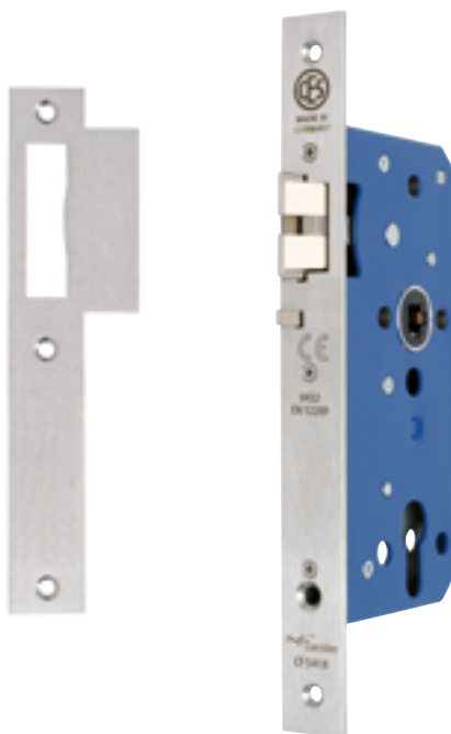
Article number 0522-17