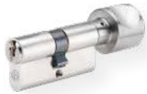
Knob cylinder no. 815 PSM Brass, satin nickel-plated Locking function on one side, aluminum knob on the other side, NF, various knob shapes available (figure shows shape H)