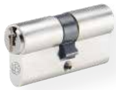
Double cylinder no. 810 PSM Brass, satin nickel plated