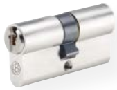
Double cylinder no. 810 PSM Brass, satin nickel plated