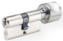
Knob cylinder no. 815 PSM Brass, satin nickel plated One side locking Other side aluminium knob, F1, various knob shapes available (figure shows shape H)